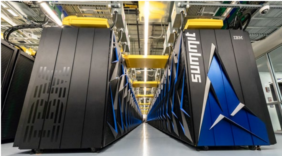
Left Summit Supercomputer.